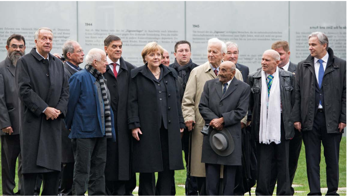
Inauguration of the memorial to the Sinti and Roma of Europe murdered under the National Socialist regime, on 21 October 2012.

Sinti and Roma features in order to facilitate expulsions. Finally, in 1926, the Bavarian state parliament adopted a “law to fight gypsies, vagrants and the workshy”, which is how so-called ‘race theory’ ( Rassenkunde ) defined Sinti and Roma.