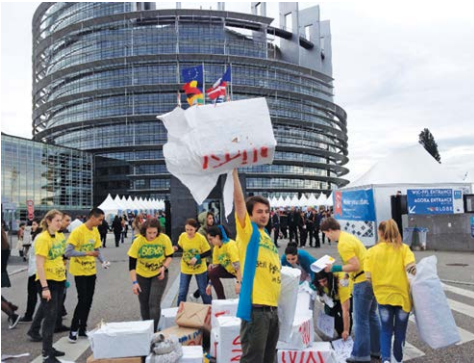
A flashmob organised by PhirenAmenca and ERGO during a European Youth Event in front of the European Parliament in May 2014.

Today's antigypsyism may not explicitly employ the notion or rhetoric of 'race', but it conveys that same ideological concept by postulating a distinct 'culture' shared by and defining all members of the thus-constructed group. Antigypsyist ideology notably always incorporates attributions that imply that those imagined to be 'gypsies' are not 'civilised' enough. Accordingly, the significance projected onto 'the gypsies' is always that they are those who do not accept, internalise or share the norms and values of the dominant ('civilised') society (or who haven't 'yet' done so). In