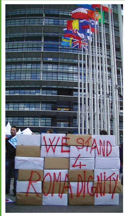
PhirenAmenca and ERGO protest in front of the European Parliament, during a European Youth Event organised by the EP in Strasbourg, May 2014.