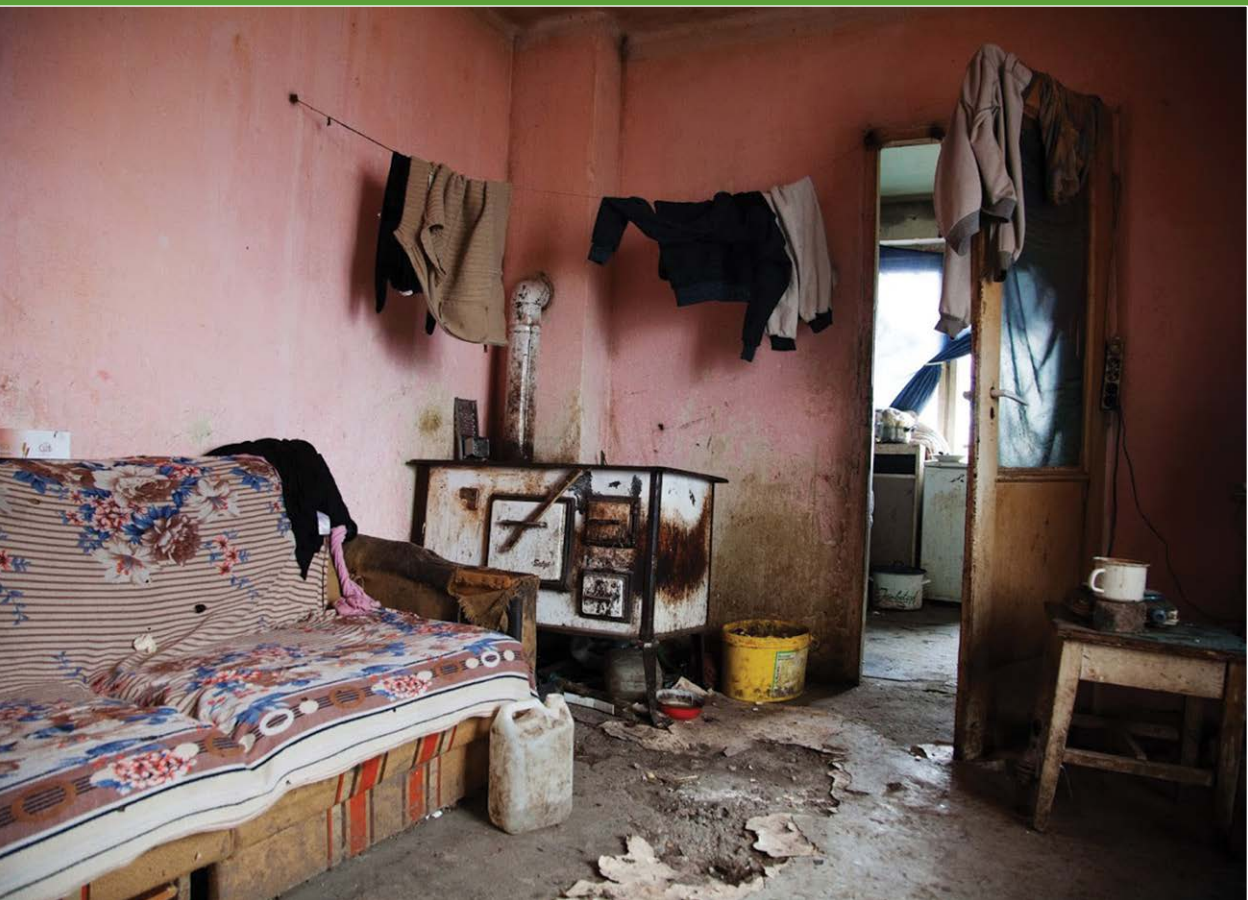
Interior of a Roma house in Sajókaza.