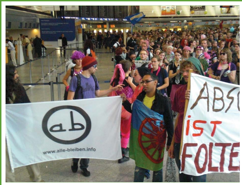
A demonstration initiated by Alle Bleiben, which opposes the expulsion of Roma asylum seekers from the Balkans, at the airport in Frankfurt, Germany in 2011.