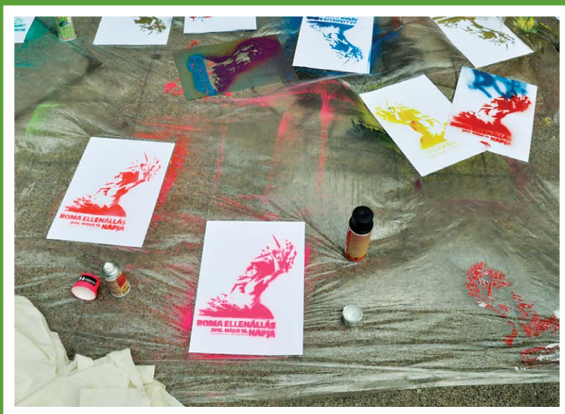
Preparations for Romani Resistance Day on 16 May, in Budapest, 2015.