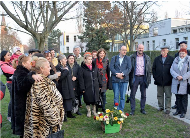
An initiative to commemorate the local communities of Lovara, Sinti and Roma in Floridsdorf, Vienna's 21st district on 17 March 2016.