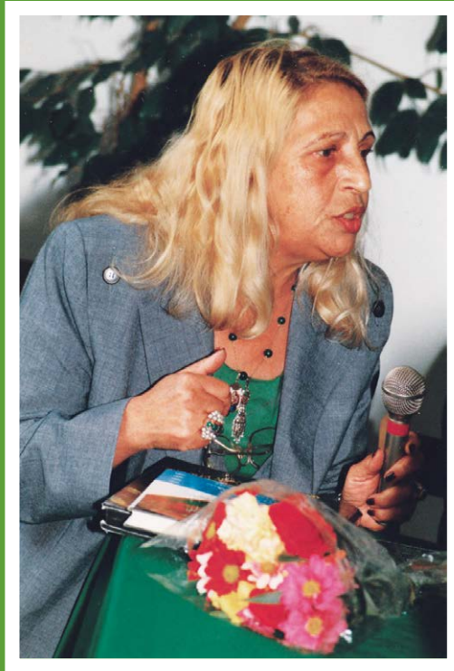
Ceija Stojka (1933-2013), Austrian Lovarica and famous artist. Her books made an outstanding contribution to deepening the understanding of Roma culture.