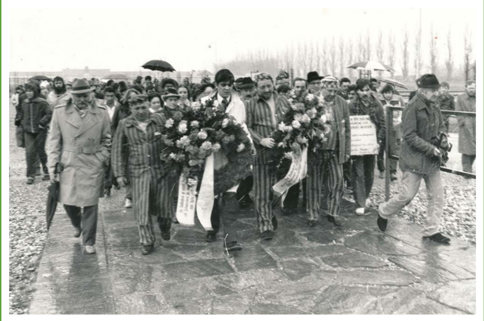
Laying of a wreath at the Dachau memorial at the beginning of the Easter 1980 hunger strike