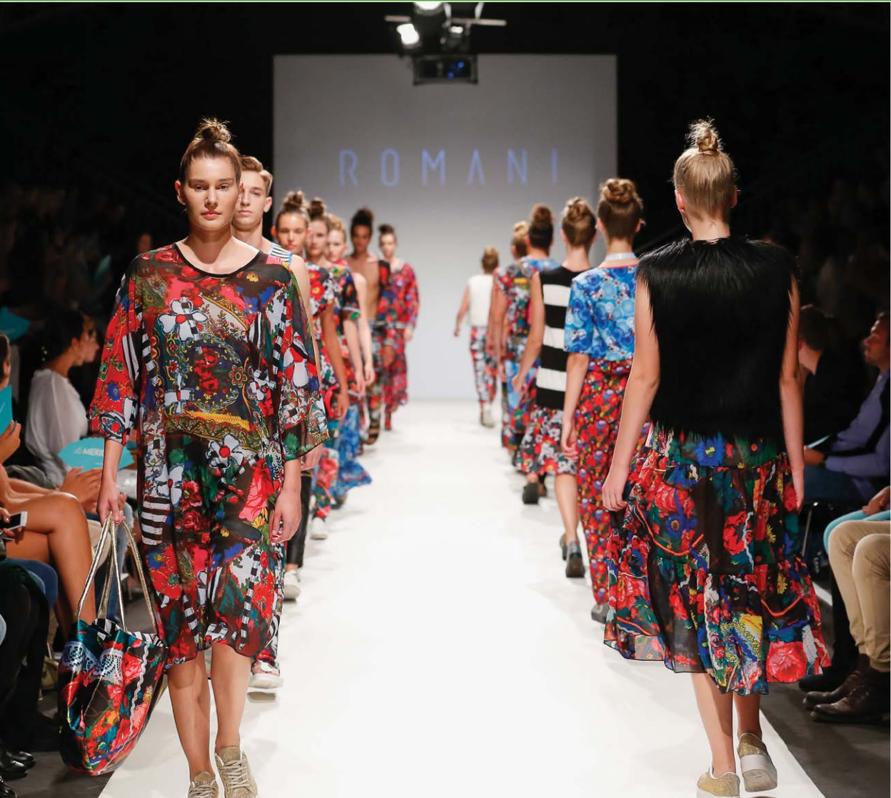
Using fashion as a means to fight stereotypes and to empower the Roma – The mission of Romani Design.