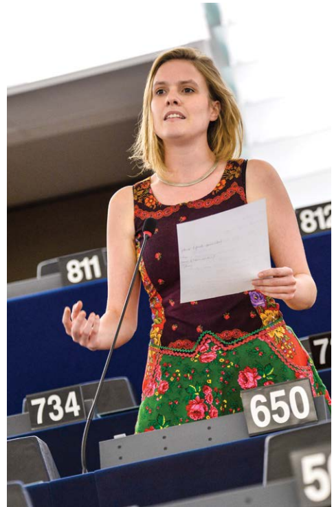
Terry Reintke addressing the European Parliament plenary on International Roma Day 2016.

depicted as uncivilised, dirty and criminal and therefore inferior to the majority population.