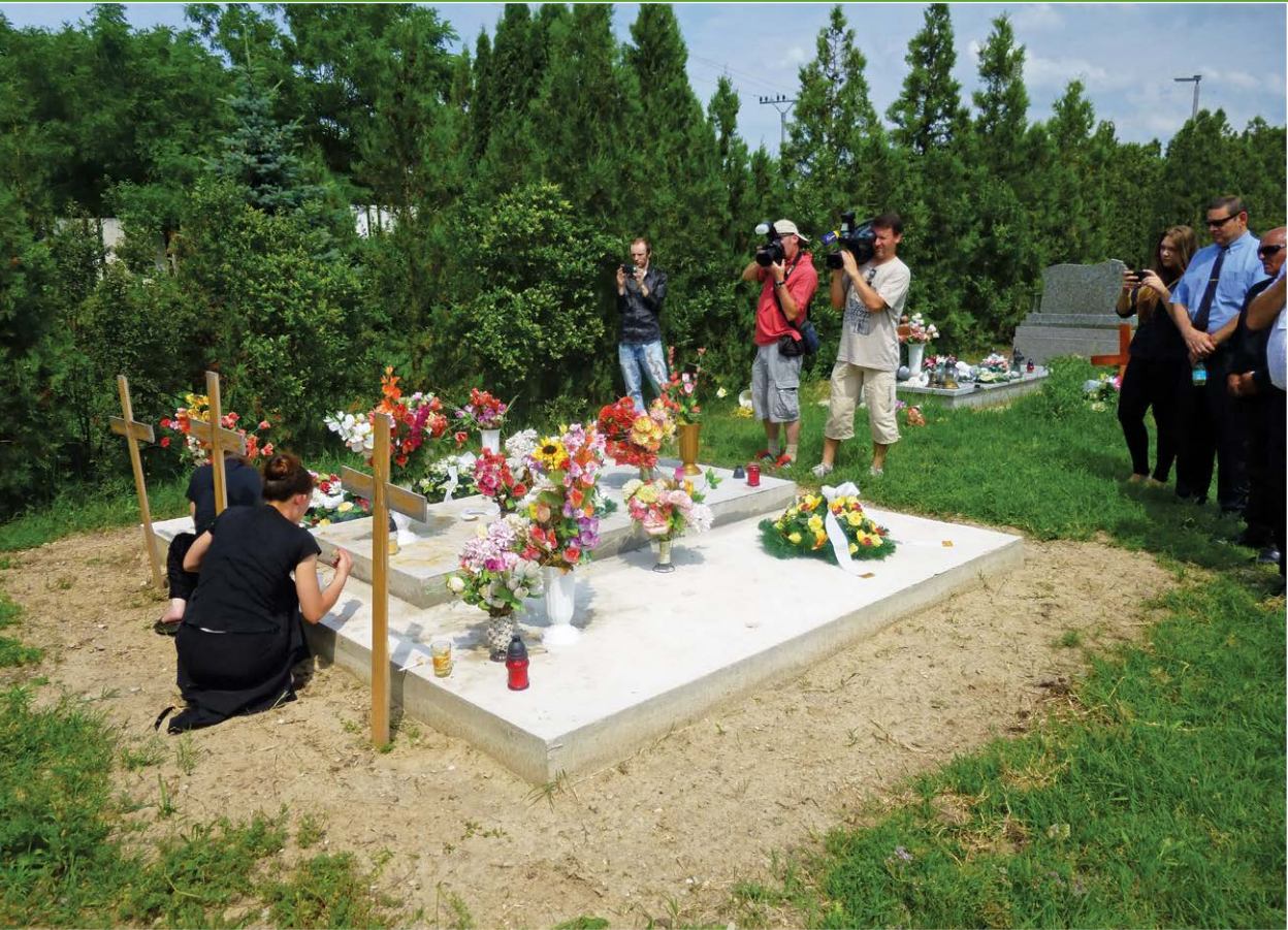
Commemoration of the first anniversary of the death of three Roma men, murdered by a police officer in an antigypsyist attack in Hurbanovo, Slovakia in 2012.